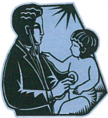
Children in foster care need regular medical & dental check ups.

The Child Health and Disability Prevention (CHDP) Program provides health exams for children to find and correct health problems early in life. These well child check-ups